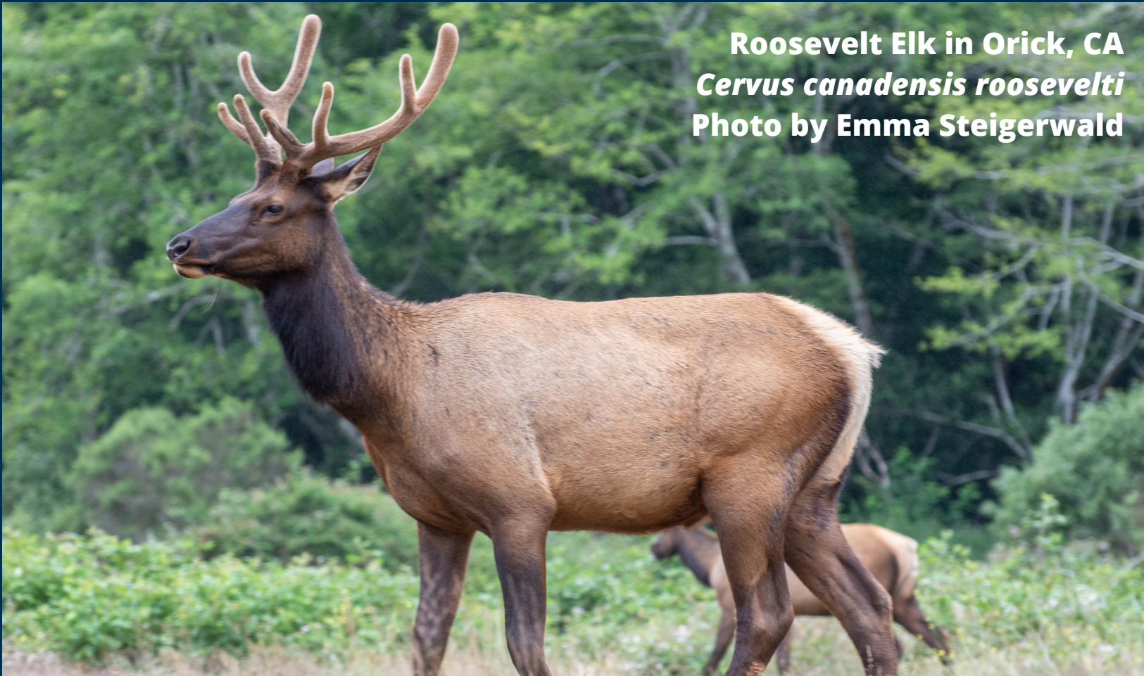
Roosevelt Elk in Orick, CA Cervus canadensis roosevelti

A newsletter highlighting members of our community