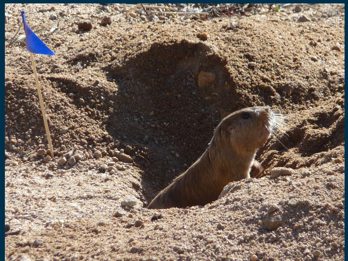
Tuco naturaleza